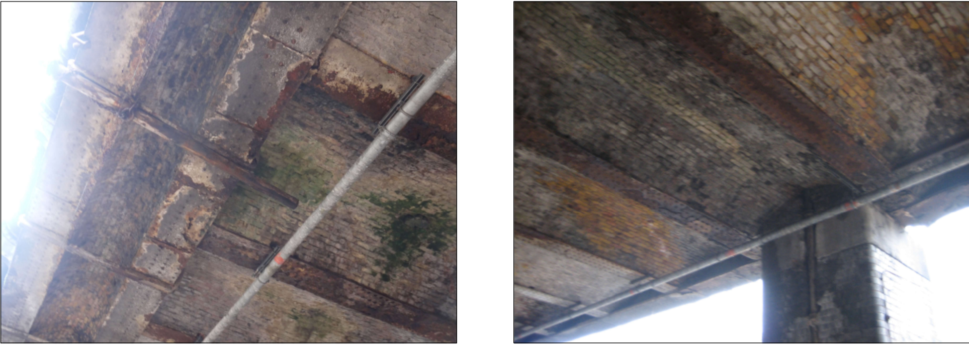
EXAMPLES OF DEGRADATION OF JACK ARCH BEAMS DUE TO WATER INGRESS FROM PARK LEVEL ABOVE - Please see Structural engineers report for description of required remedial works.